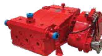
Pump Performance Chart - AB-L600